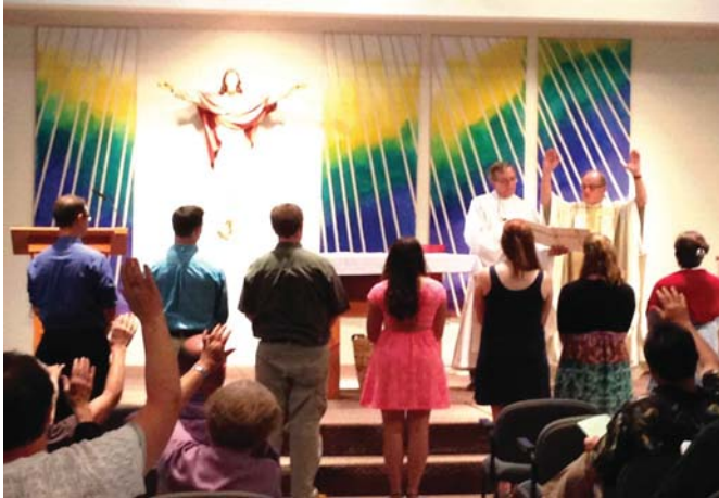
Graduating Seniors are recognized at the graduation mass!