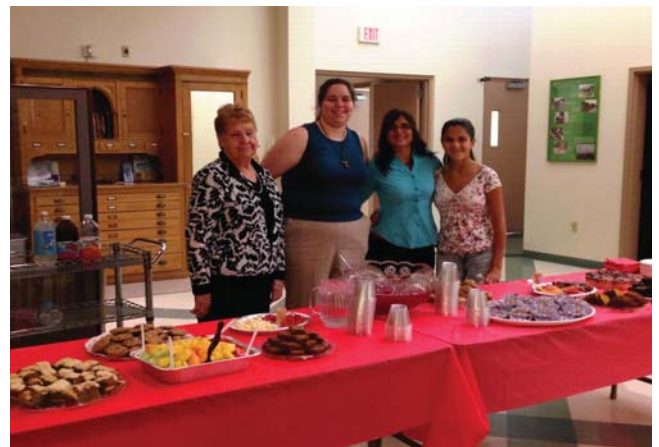
Hospitality For Families of Confirmation Candidates: Thank you to all who bake and work tirelessly To fulfill our commitment to create a "welcoming community!"