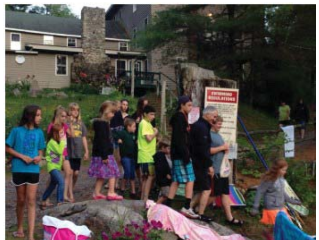
Do You See That Shark In the Lake?