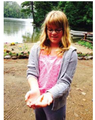
Salamanders For Supper