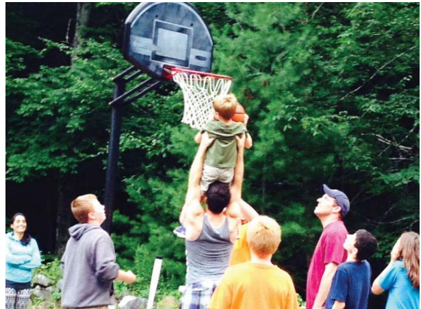
Even the munchkins got slam-dunks at the great Pyramid Lake Basketball Championship game with Staff!