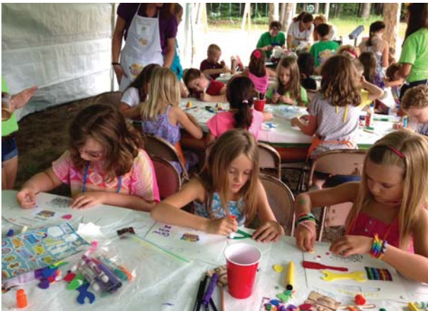
Vacation Bible School Crafters