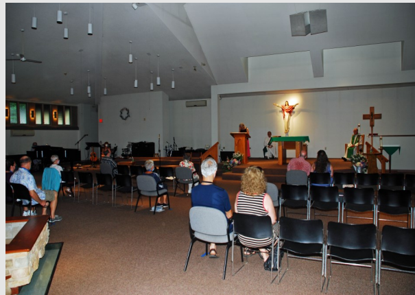
6 ft. apart