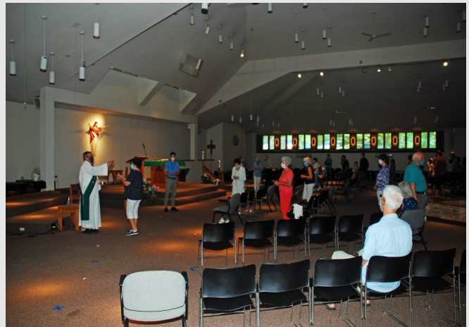
Social Distancing With Masks